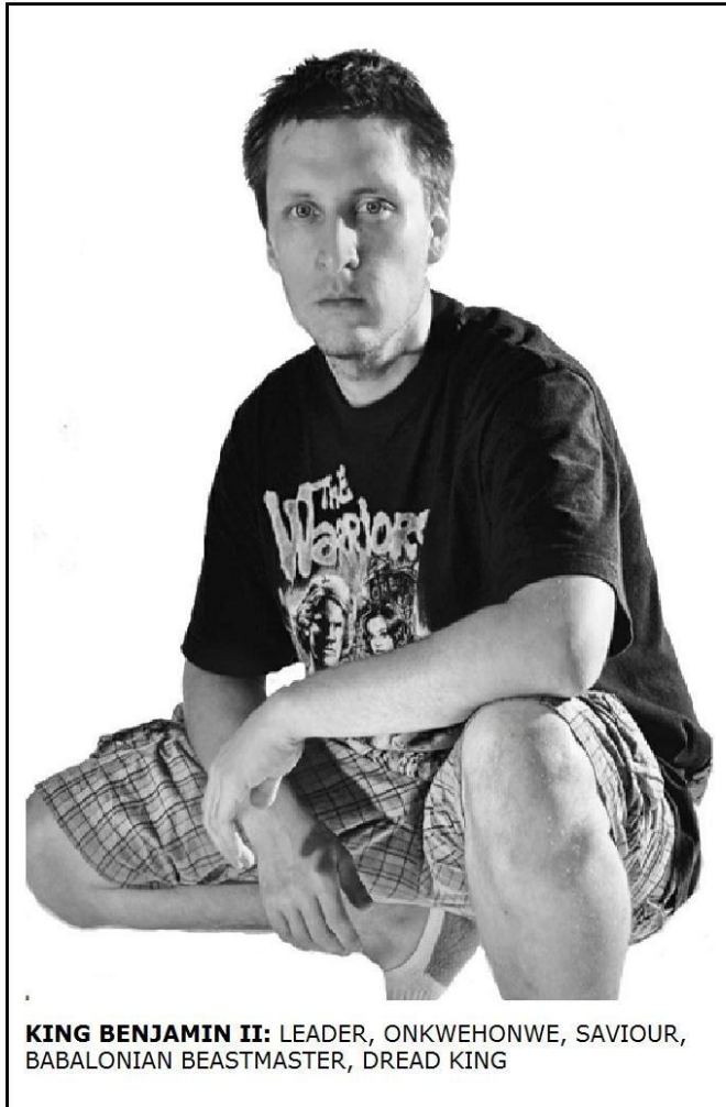
KING BENJAMIN II: LEADER, ONKWEHONWE, SAVIOUR, BABALONIAN BEASTMASTER, DREAD KING

Please consider becoming a citipen of my country. You will have full say in every decision along the way. It could be the most democratic democracy in the world, but it needs, YOU!